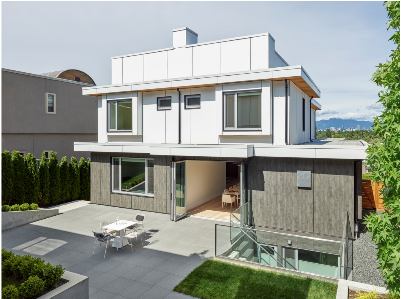
Outside Seating

Single Family | Vancouver West | Contemporary | Modern | Serene | Minimalistic | Effortless | Sophisticated