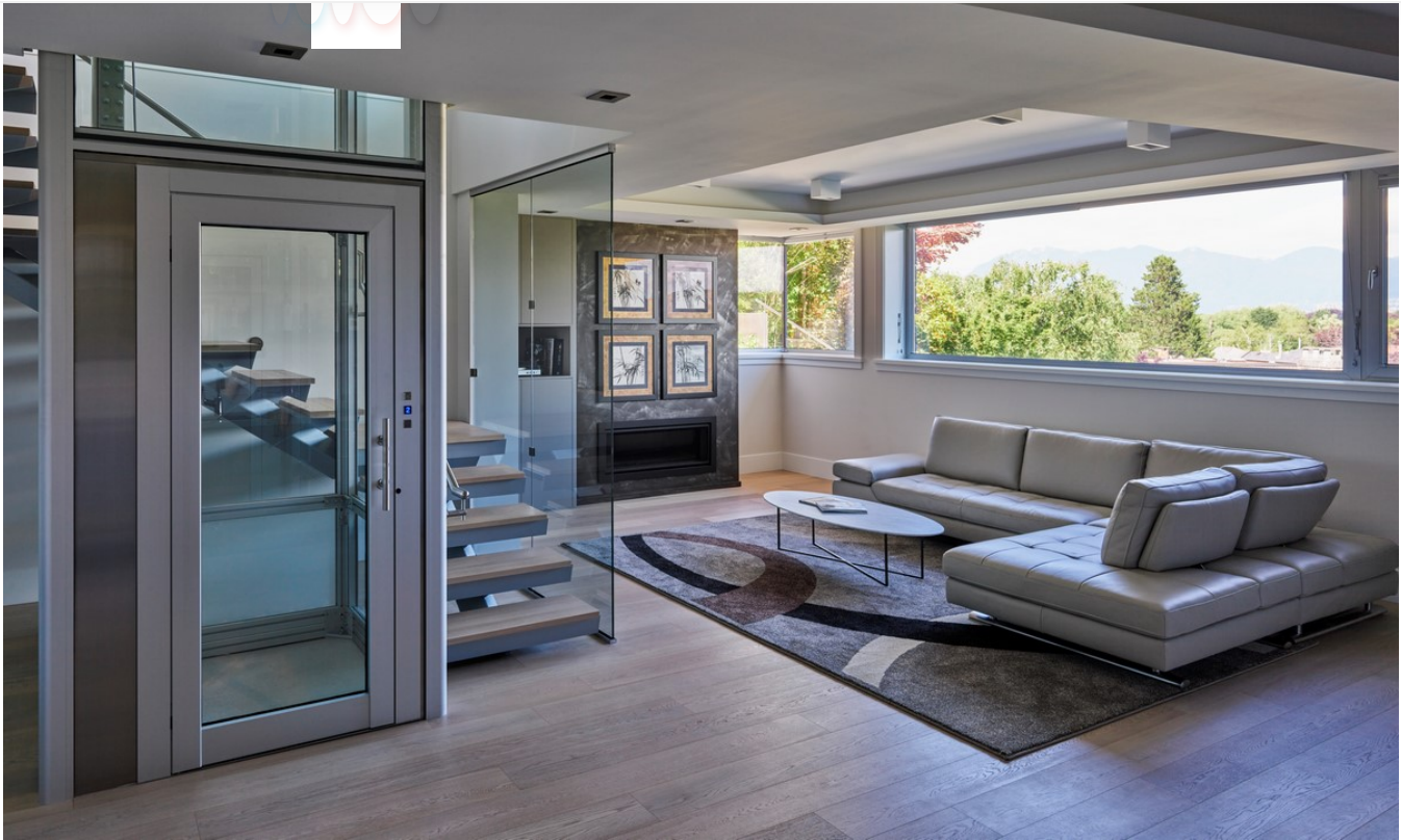
Living Room