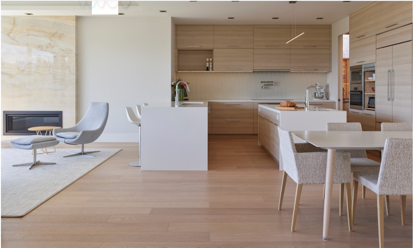
Kitchen+Dining ©Andrew Latreille