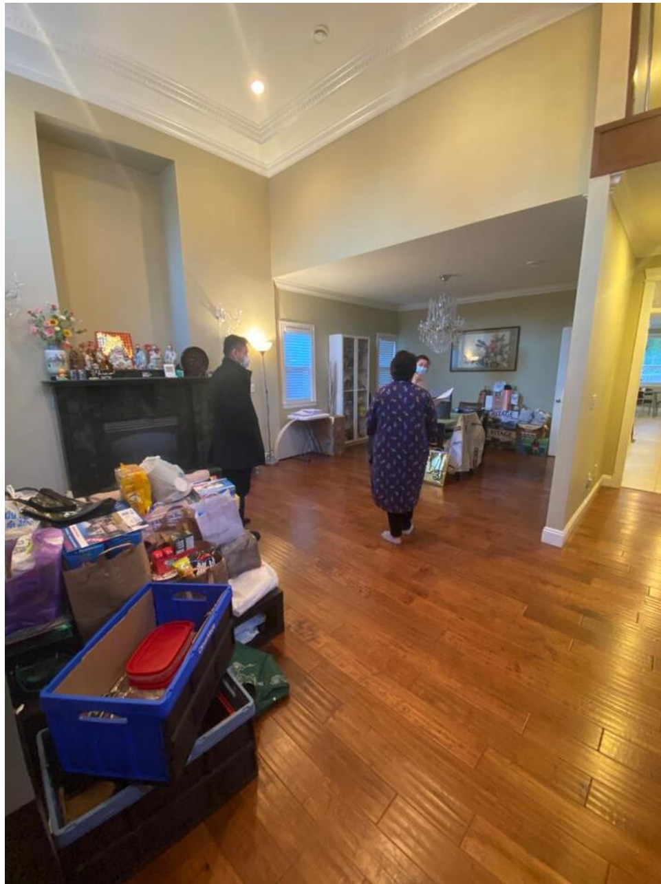
AFTER: Living Room